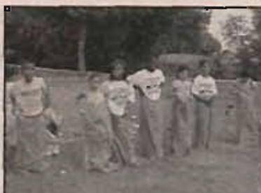
Children enjoy a potato sack race during the annual Plano Housing Authority's Fall Fest