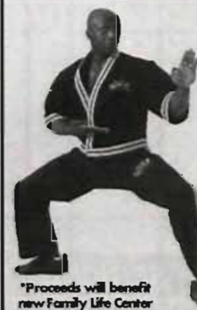
*Proceeds will benefit new Family Life Center