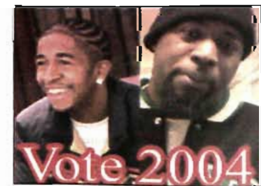
Hip Hop Artists Omarion and David Banner

Boston--(Black Pr Wire)(Business Wire) Nearly 5,000 youth participants rallied at the Boston Hip-Hop Summit today in the heart of Boston's Roxbury community, while thousands of delegates were preparing to attend the opening of the Democratic National Convention. Members of Congress, State Legislators,