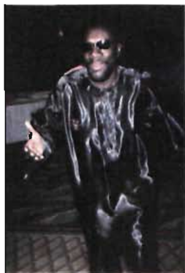
Issac Hayes, Humanitarian Award Recipient

was recently held in June at the Loews Miami Beach Hotel.