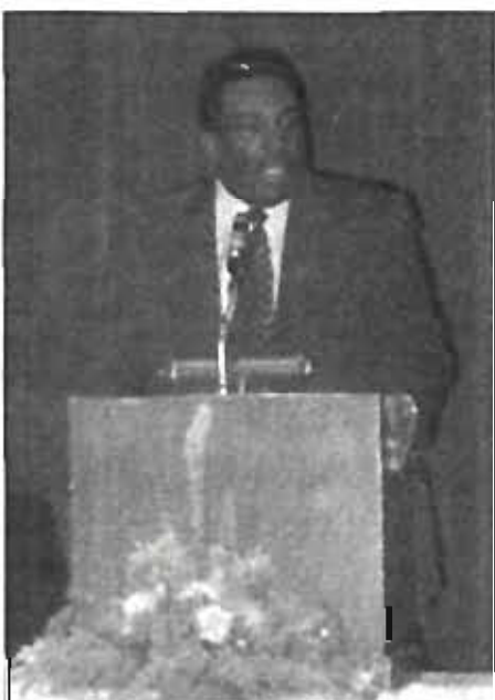
Senator Royce West (D) Honorary Chair for the Dallas Arts Gala Benefit

Tickets are on sale now. Prices are $25, $35 $50, $100 and are available at TicketMaster 214-373-8000 and The Black Academy of Arts and Letters box office at 214-473-2400.