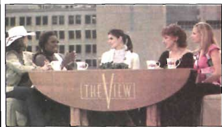
The View Co-hosts with guest Angie Harmon Left to Right: Meredith Vieira, Star Jones, Angie Harmon, Joy Behar, Elisabeth Hasselbeck

The View is the strongest performer among women age 18-49. The View is the original forum where real women discuss relevant, everyday issues and share