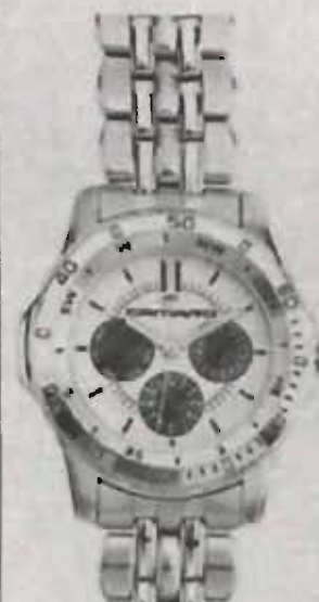
Camaro -- Also Available as Mustang, Ford, Chevy, Dodge, etc.