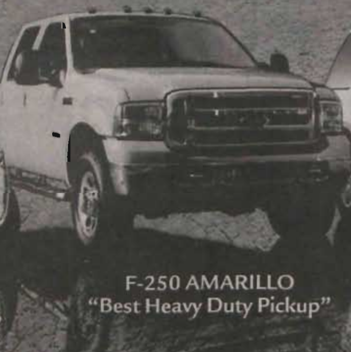
F-250 AMARILLO "Best Heavy Duty Pickup"