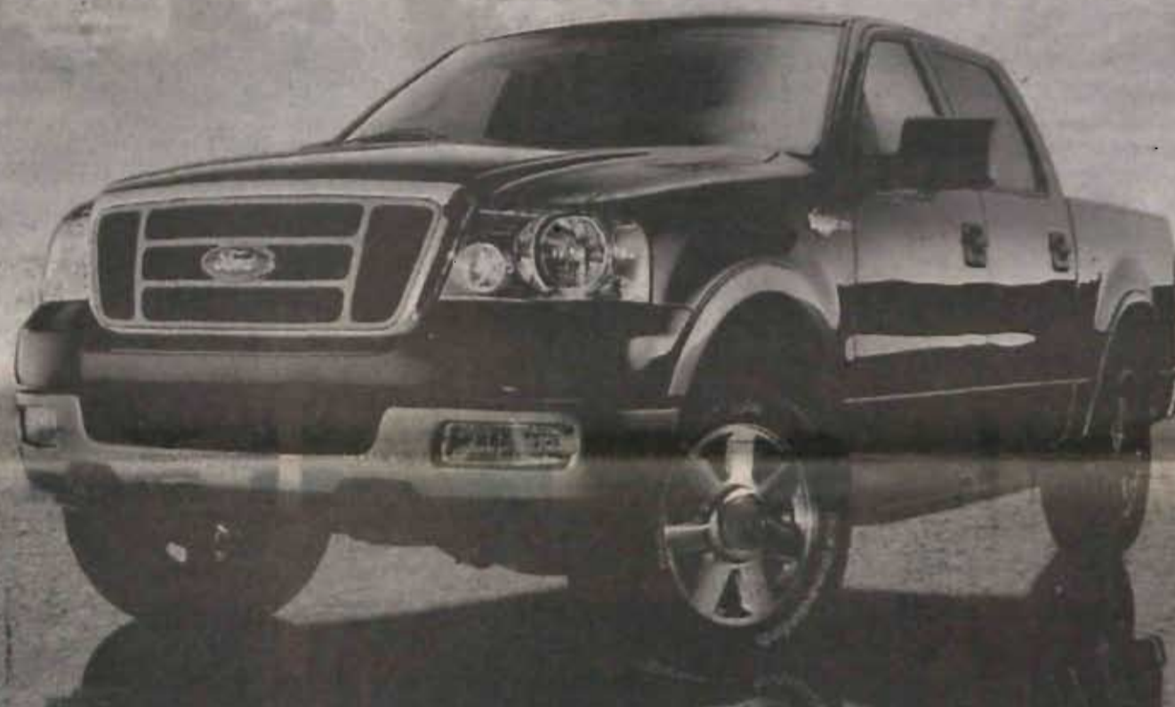
F-150 4x4 KING RANCH "The Truck of Texas"