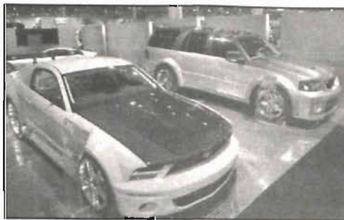
Shelby shows it can design more than sports cars — the beauty in the background is a Shelby Expedition.