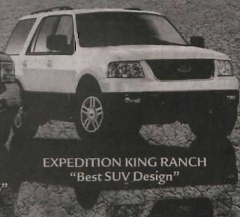
EXPEDITION KING RANCH "Best SUV Design"

FORD TRUCKS — "The Truck Line of Texas" 5 Years Straight