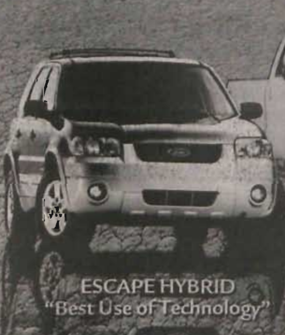
ESCAPE HYBRID "Best Use of Technology"