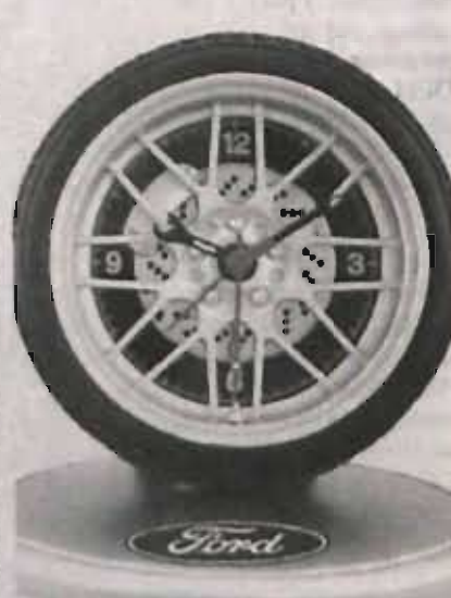
Ford Tire Desk Clock - also available as Chevy and many others.

Those who are interested in any automotive brand of watch or clock can call Lone Star Classic Auto (214-289-5192) to discuss the watches and availabilities further.