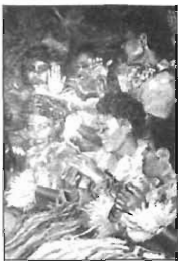
"In Celebration" painting of local women on the Island of Fiji completed in 2004.

Dunbar has landed her first one million dollar commission to paint the Island of Fiji. To complete this work she will spend quality time on the island. Fiji is an independent state in the S.W. Pacific. It is east of Vanuatu and consists of two large islands (Viti Levu and Vanua Levu).