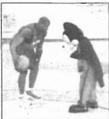
The Renowned Miami Heat Center Teams Up With Mickey for the Gala Christmas Day Holiday Telecast

LAKE BUENA VISTA, Fla., PRNewswire/— Shaquille O'Neal takes center court as the newest guest star recruit for the Walt Disney World