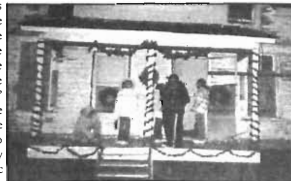
Historic Thornton House.

Tentatively, the museum is set to open around the spring or summer.