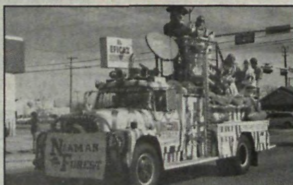
Naaman Forest High Booster Club