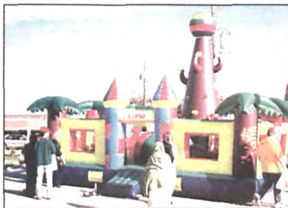
Games for Kids