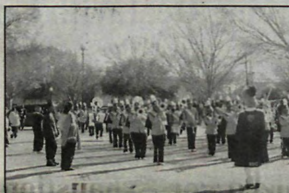
South Oak Cliff High School Marching Band