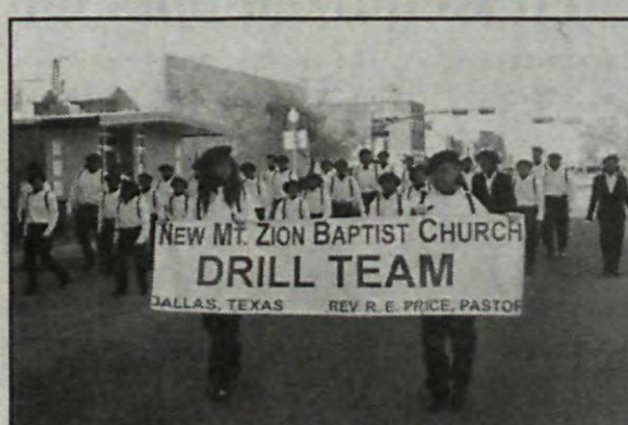
New Mt. Zion Baptist Church Drill Team