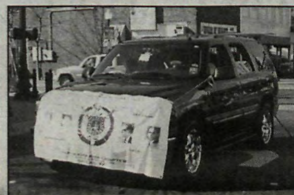
Members of Omega Phi Psi Fraternity