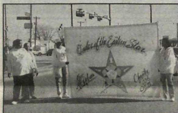
Mt. Hebron Baptist Church Order of the Eastern Star participants