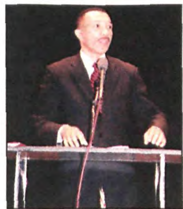
Kweisi Mfume Speaks Page 4