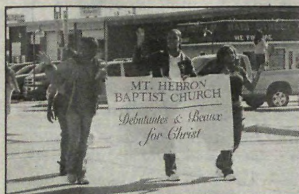
Parade marchers from Mt. Hebron Baptist Church