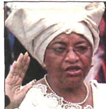
New Liberian President Ellen Johnson Sirleaf Unveils First Nominations for Cabinet-Level Positions