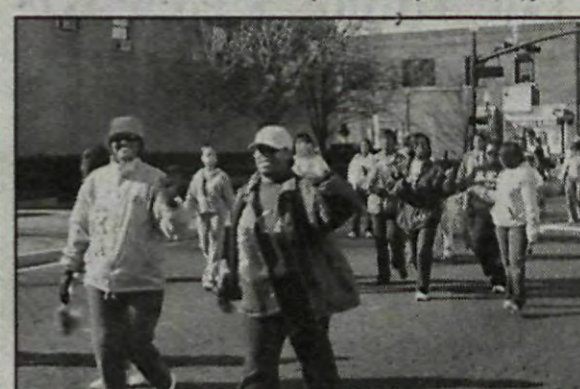
Members of Alpha Kappa Alpha Sorority