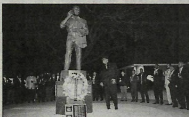
Members of Alpha Phi Alpha sing in honor fellow fraternity member Dr. Martin Luther King, Jr.