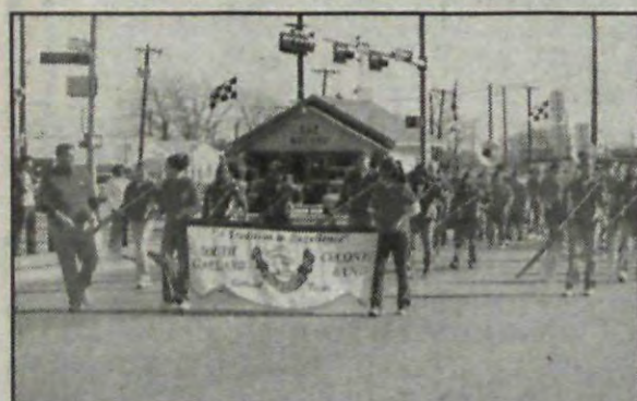
South Garland High Marching Band