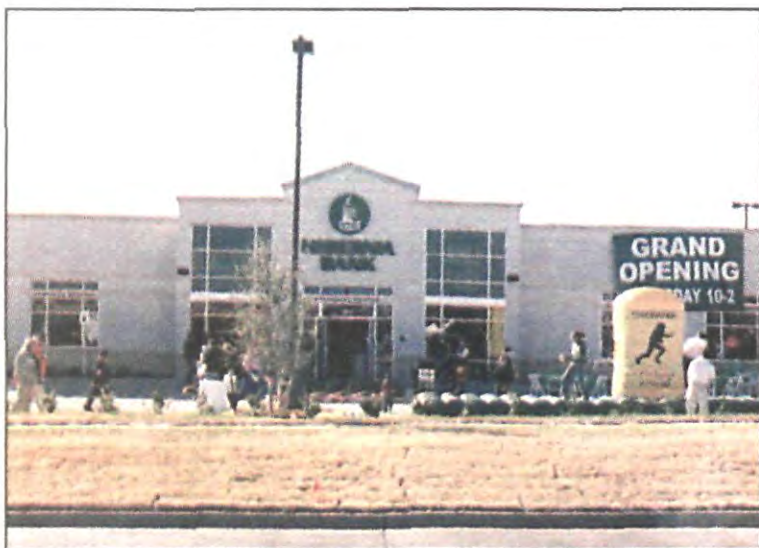
Hibernia Bank (Los Rios and 14th Street)