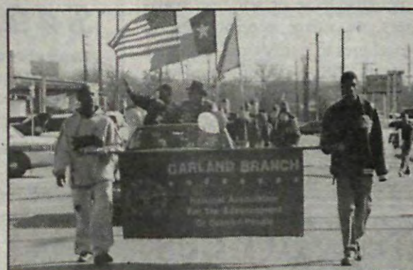
Members of Garland NAACP