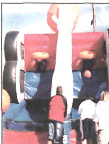
Games for Kids

Hibernia Bank recently celebrated the grand opening of a new