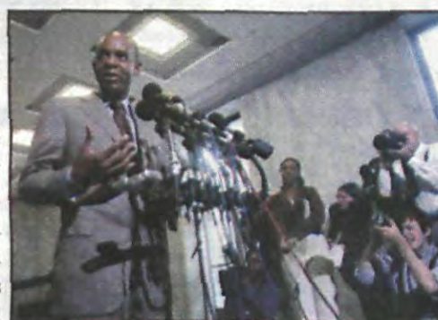
Congressman William Jefferson (D-LA) speaks to members of the press on Capitol Hill in Washington, District of Columbia on Monday, 22 May 2006. Jefferson spoke publicly after his office was searched over the weekend, and the Federal Bureau of Investigations (FBI) alleged that agents videotaped him taking a $100,000 USD bribe from an FBI informant

times fractious group, and they're not of a single mind on Jefferson, D-La., who's the subject of a corruption probe.