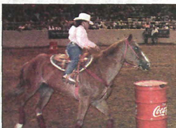
Cowgirl performing barrel racing event