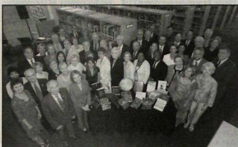
The honorees of the President's Circle were recognized May 24, for their generous giving and support of Collin County Community College District.

Collin County Community College District (Collin) recently announced its second annual President's Circle honoring businesses and individuals who have generously supported the college.