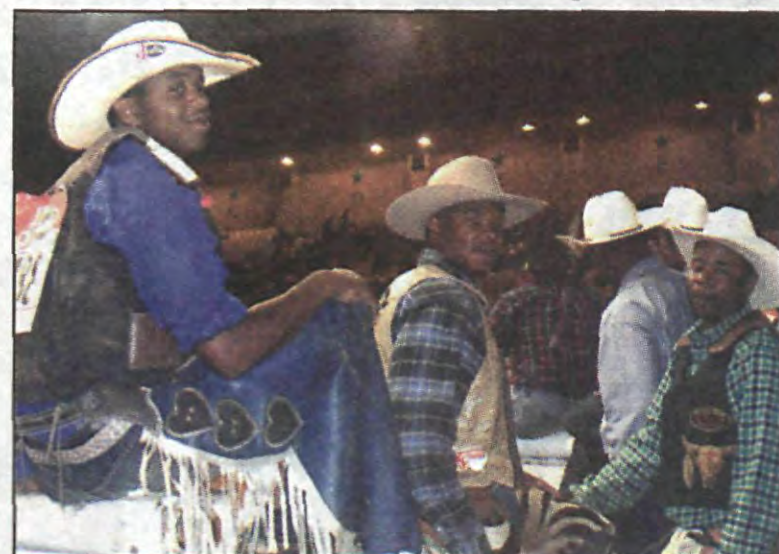
Cowboys waiting to run their heat at the 21st Texas Black Invitational Rodeo

The African American Museum celebrated the 21st Texas Black Invitational Rodeo on May 27th at the State Fair Coliseum in Historic Fair Park.