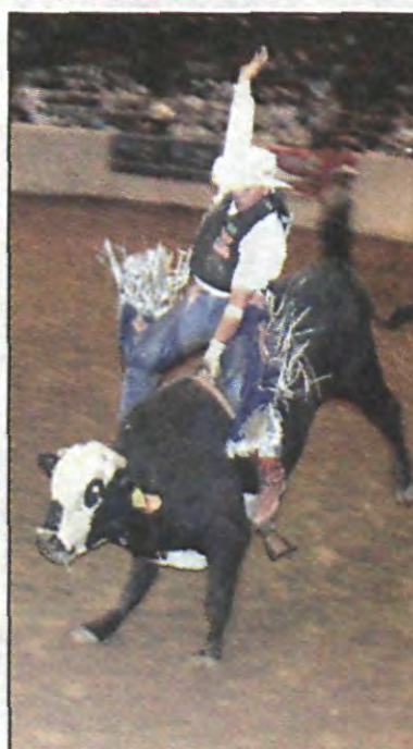
Cowboy trying to get the eight seconds at the 21st Texas Black Invitational Rodeo