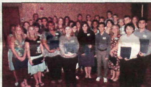
Collin Scholarship Award Winners