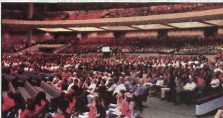
PISD employees at district's August Convocation