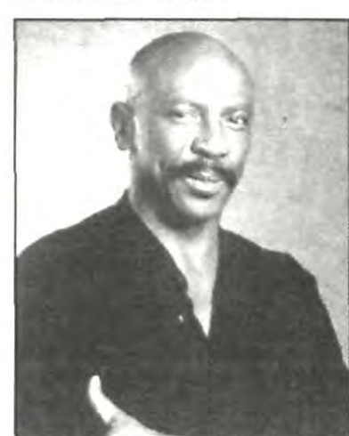
Louis Gossett Jr.