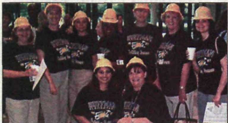
Huffman Elementary School Faculty & Staff are 'Building Success.'