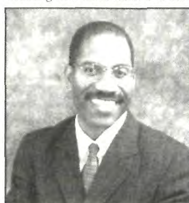
save hundreds of dollars.

4. Don't be afraid to buy some clothing at a thrift store. You can