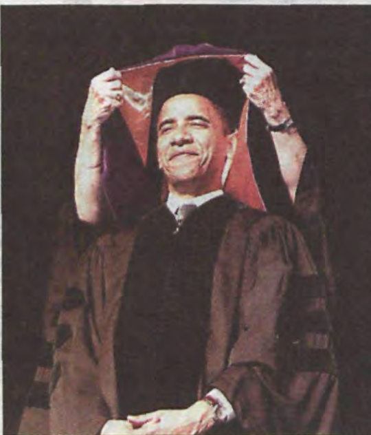
U.S. Sen. Barack Obama, D-Ill., receives an honorary Doctor of Laws degree during the commencement program at Xavier University of Louisiana in New Orleans on Saturday, Aug. 12, 2006.

Nearly a year after Hurricane Katrina submerged Xavier University's campus under eight feet of water, Illinois Sen. Barack Obama on Saturday joined the school in celebrating one of its largest graduating classes.