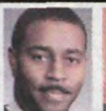
Justice Wainwright TX Supreme Court