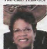
Judge Brenda Green