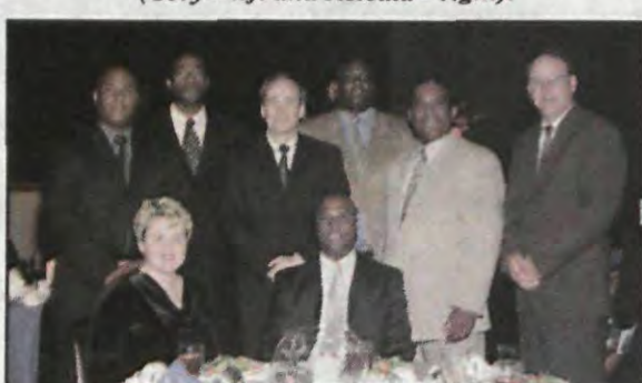
Members of the Plano Police Department.