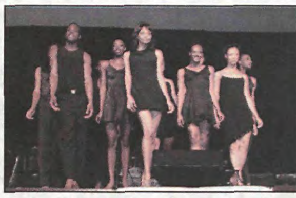
Members of the Dallas Black Dance Theatre Company performs for the audience.