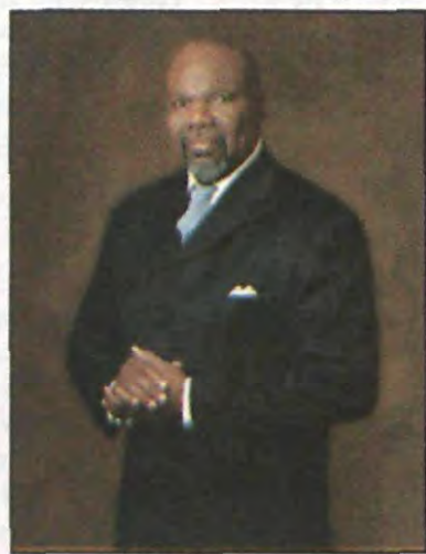
Bishop T.D. Jakes

The focus of Clay Academy is to inspire students of purpose from across the Metroplex and beyond to become tomorrow's change leaders today. Through its capability of global satellite communications, diverse faculty and student body and cultural framework of education, Clay Academy has set itself up as a