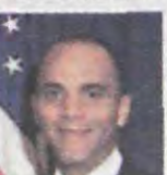
Justice Wallace Jefferson