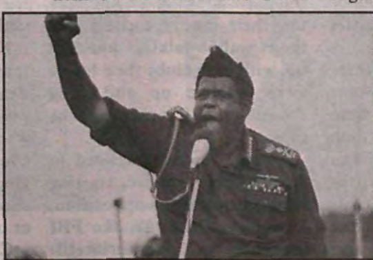
Forest Whitaker, "The Last King of Scotland"

"Hotel Rwanda" earned Oscar nominations for Don Cheadle and Sophie Okonedo, "The Constant Gardener" won the supporting-actress Oscar for Rachel Weisz, and other productions set in Africa have drawn