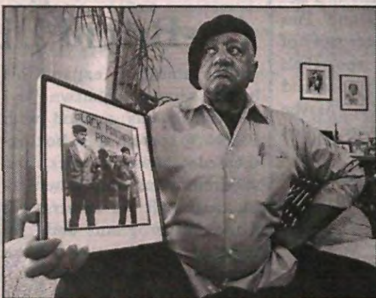
Former Black Panther Party national chairman Bobby Seale holds a February 1967 photo at his home in Oakland, Calif., Wednesday, Oct. 11, 2006, of himself, left, wearing a Colt.45, and his Black Panther co-founder Huey Newton, right, with a bandoleer and shotgun in Oakland. The Black Panther Party officially existed for just 16 years. Seale never expected to see the 40th anniversary of the Black Panther Party. Seale and other party members are to commemorate the anniversary when they reunite in Oakland this week.

The militant approach, which frightened many white Americans, set the Panthers apart from other activist groups.