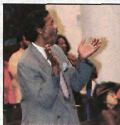
Patron enjoys Gospel Fest