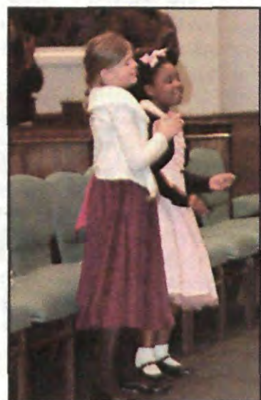
Area children join in praise