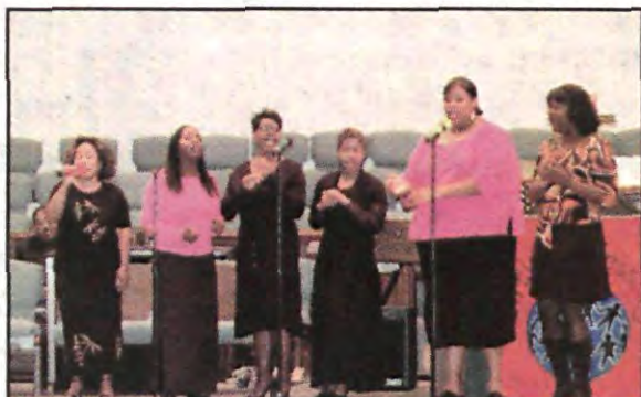
True Praise Gospel Group