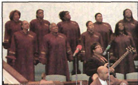
Shiloh Missionary Baptist Church Choir entertains the crowd