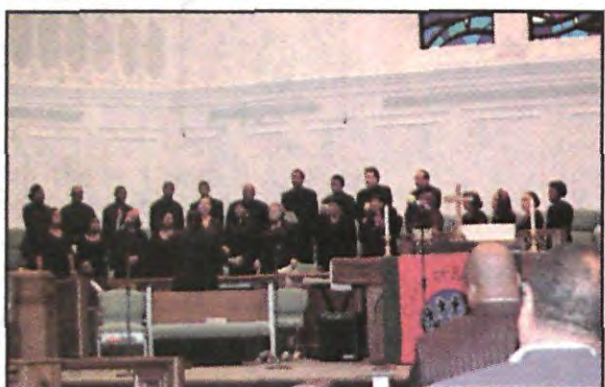
The Workshop choir sings praises

The Plano African American Museum hosted their first annual Gospel Fest at the First U.M.C. of Plano. This year's Gospel Fest featured various songs from choirs such as the Shiloh M.B., a workshop choir and the gospel group True Praise. All proceeds will fund activities of The Plano African American Museum.