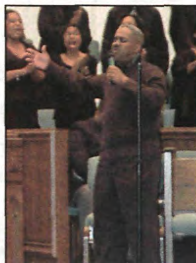
Workshop choir Soloist sings from the heart