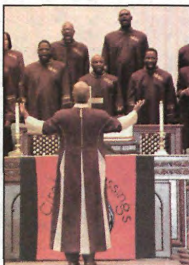
Shiloh Missionary Baptist Church Choir