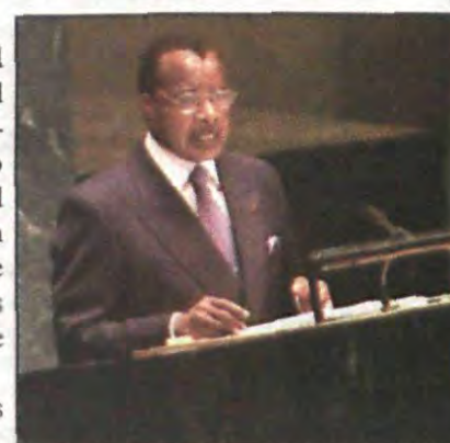
Denis Sassou Nguesso, President of the Republic of Congo, addresses the UN General Assembly at the United Nations, in New York. Nguesso said on Tuesday U.N. forces should protect the borders of Chad and Central African Republic, countries into which violence has spilled from neighboring Sudan's Darfur region.