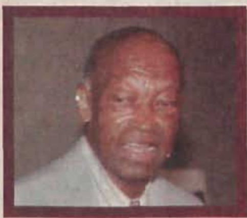
RC Hickman Photography Workshop