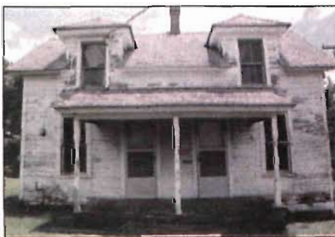
At the center of controversy - could this historic house at 900 E. 13th be the first African-American museum in Plano?