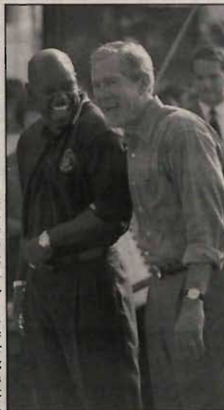
Bush's recent "Healthier US" Campaign. "I consider it a genuine honor to be chosen for the

Physical Fitness and Sports at the White House Fitness Expo is part of President