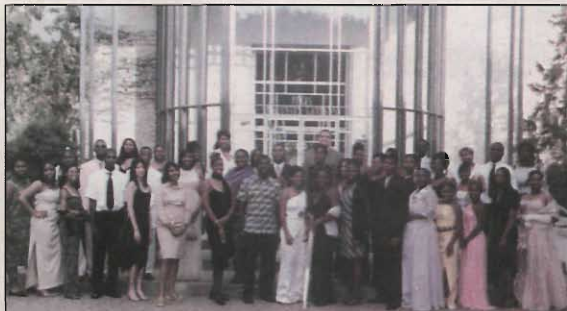
CRYSTAL Scholarship Award Recipients

DALLAS – The Dallas Housing Authority (DHA) awarded nearly $40,000 to several high school seniors at the annual CRYSTAL Scholarship Awards Banquet – “Celebrating Rising Youth in their Successes, Talents, Achievements and Leadership.”