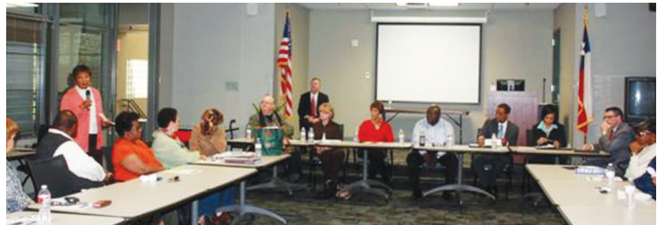
Congresswoman Johnson spoke with panelists about ending the homeless veteran problem in Dallas

DALLAS — Recently, Congresswoman Eddie Bernice Johnson launched her small business series to assist homeless veterans in the Dallas area. The purpose of the series is to inform homeless veterans about the Veterans Affairs Supportive Housing (VA-SH) program and provide them with the tools they