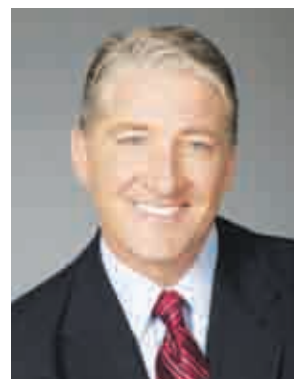
CNN's John King

Stuart was too much a coward to be judged by a jury of his peers, but hundreds of Black men could not escape the injustice of the Stuart accusations. The Roxbury community was traumatized by the results of Stuart's lies. Innocent