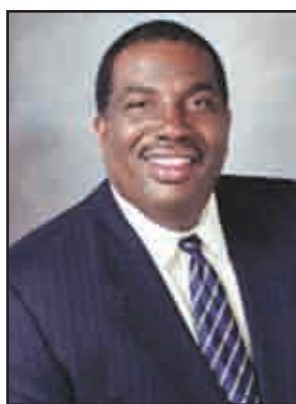
Senator Royce West

Bids are available for view at: http://www.tpwd.state.tx.us/business/bidops/current_bid_opportunities/index.phtml