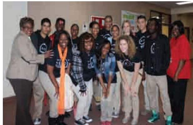
Cedar Hill High School Heroes

CEDAR HILL - Real-life heroes from Cedar Hill High School visited younger students on April 10. It was part of the annual High School Heroes program where older students visit eight lower grade schools to share how to succeed in school and life.