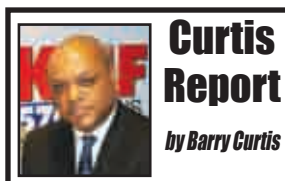
Curtis Report by Barry Curtis

The defendant also failed to register as a debt management services entity with the Office of Consumer Credit Commissioner, a violation of the Texas Finance Code.