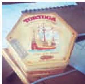
Tortuga rum cake

inviting me to take time for a manicure and pedicure using their 3 in 1 Nail File and their Flexible Foot Smoother. The 3 in 1 Nail File which I received in snow white, is available in bubble gum pink and green apple for only $4.99. So often brands boast about being ergonomically de-