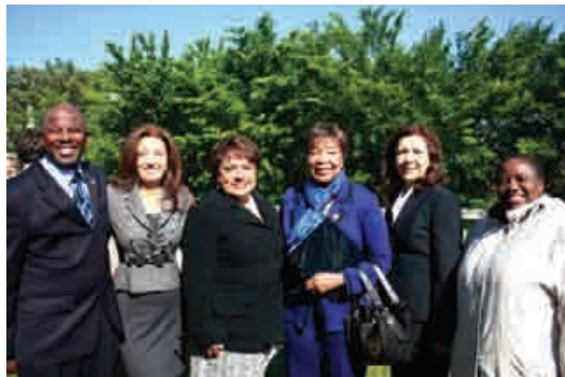
Congresswoman Johnson and members of the Dallas City Council at the streetcar groundbreaking ceremony

"I worked diligently to get federal funding for this project, but all of you made this happen," said Congresswoman Johnson. "The Dallas Union Station to Oak Cliff Streetcar project is a great example of everyone coming together to pursue a multi-modal transportation system in North