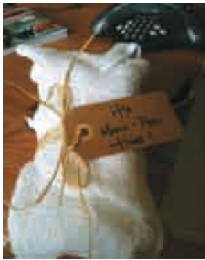
Affordable pampering products from Every Beauty

First, I received a couple of affordable beauty care products from Every Beauty. When I opened the box it contained products gift wrapped in a washcloth