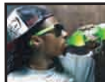
Lil Wayne is just the latest celebrity whose misdeeds catches up with him