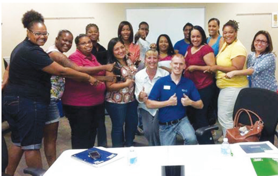
On last Saturday Intouch Credit Union taught single moms the financial ropes.