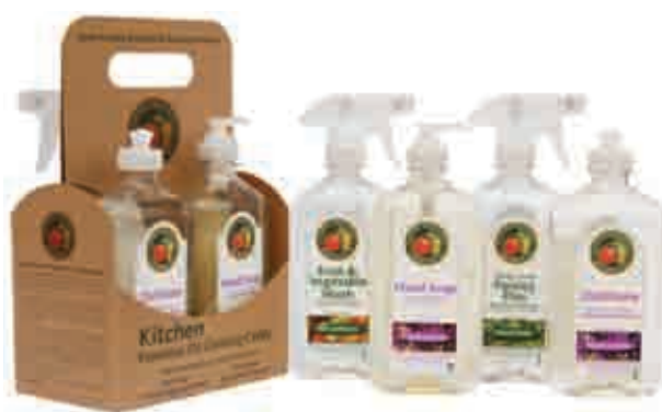
Household cleaning products are responsible for almost 10 percent of all toxic exposures reported to U.S. poison control centers. Fortunately, there are plenty of safer alternatives available, from brands like Ecover, Seventh Generation, Green Shield and Earth Friendly Products, pictured here.

According to the Washington Toxics Coalition, leading offenders include corrosive drain cleaners, oven cleaners and toilet bowl cleaners. Contact with these chemicals can cause severe burns on the eyes and skin and damage the throat and esophagus if ingested. The chlorine and ammonia contained in some can each cause similar problems, and the hazardous gases unleashed when they combine can be lethal. Other ingredients to avoid for many reasons include diethanolamine (DEA), triethanolamine (TEA), 1,4-dioxane, ethoxylated alcohols, butyl cellosolve (aka ethylene glycol mono-butyl ether), and p-nonylphenol.