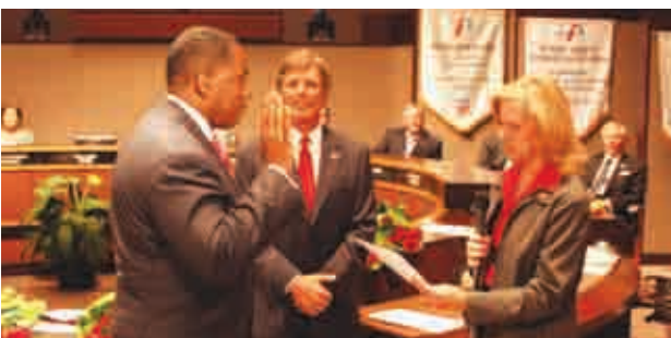
Mayor Harry LaRosiliere

Monday night after Plano City Council canvassed the election votes, Harry LaRosiliere was sworn in as the new Mayor.