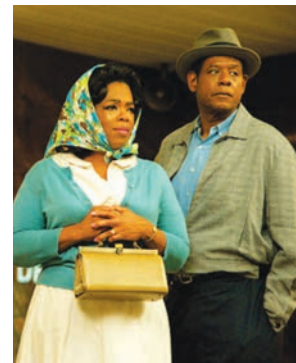
Mad Black Woman in 2005.

Years ago, someone appearing on the Oprah show, schooled us to the importance of opening weekend box office. It is why I have been known to drag myself to a movie the first weekend to lend my support and walked out pleasantly surprised at how much I enjoyed the film. One of the first was Denzel Washington's incredible performance in 1999's Hurricane . The second time was when I dragged myself to see Tyler Perry's Diary of a