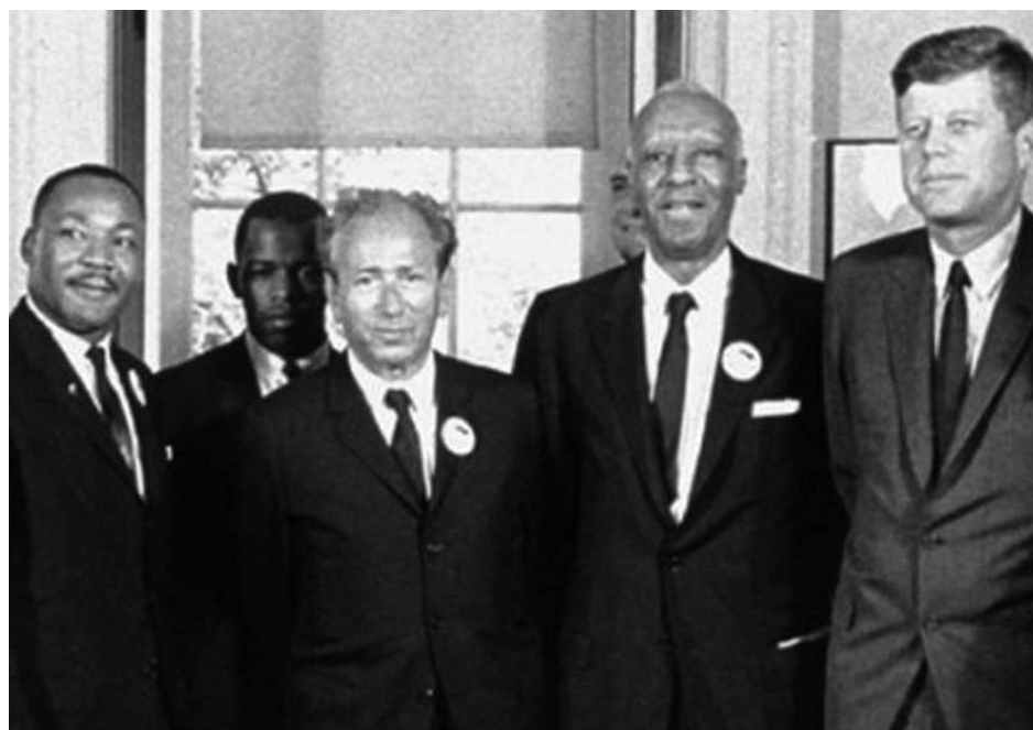
On Aug. 28, 1963, the day of the march, the civil rights leaders who met with JFK included (from left to right): Dr. Martin Luther King, John Lewis, Rabbi Joachim Prinz, the head of the American Jewish Congress, and A. Philip Randolph, leader of the International Brotherhood of Sleeping Car Porters.

King loved the idea of a second Emancipation Proclamation. He thought it would be easier for Kennedy than passing legislation—southerners had strangled every significant civil rights proposal in Congress for a century. At the same time, King hoped for an initiative by the president to make things easier for a struggling civil rights move-