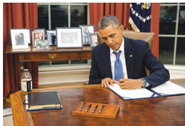
President Obama signs a stop gap measure while Congressional foolishness continues

ronments. Congress was designed to be the institution