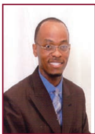
Ramon Hodridge, Minister

Radio Program @ 7:30 am on KHVN 970 AM Sunday Mornings