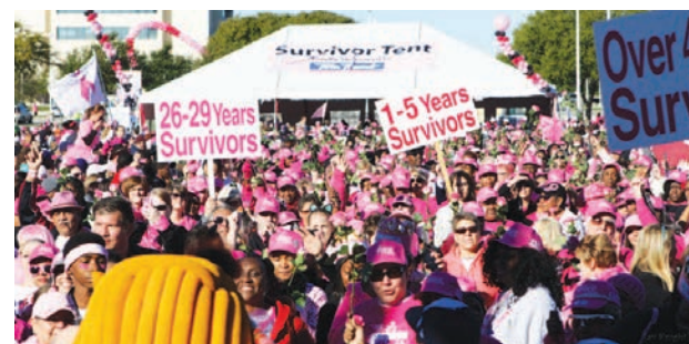
Breast cancer survivors are celebrated at the 31st Komen Dallas Race for the Cure during the annual Survivors March. The Race funds lifesaving breast health services for uninsured Dallas County residents and national breast cancer research.

In the last five years alone, the Komen Dallas Race has helped fund $9.4 million in no-cost breast health services for