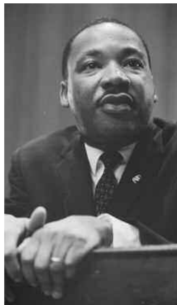
Dr. Martin Luther King, Jr. (January 15, 1929-April 4, 1968)