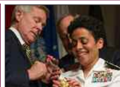
Adm. Michelle Howard

In June 23,000 visited NorthDallasGazette.com - news added daily!