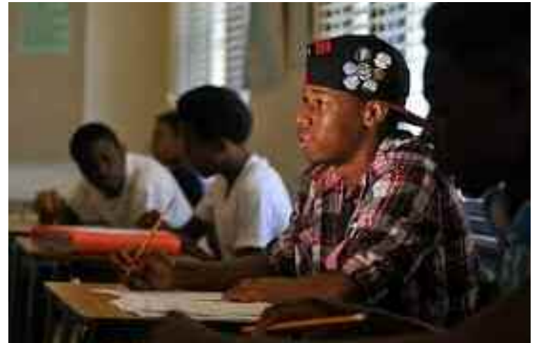
ACT officials say there is a gap between students who aspire to attend college and those who actually enroll.

“But I think most concerning, is that we still see a large percentage of students — over 30 percent — who our research indicates aren’t ready for any of the corresponding college courses in English, math, reading and science,” he said.