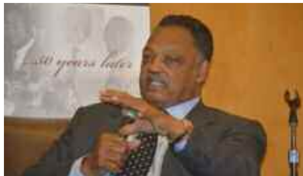
Jesse Jackson at SCLC 2014 convention in Birmingham, Ala.

"As I looked at everybody's fight for who can make the smallest government, I thought about our being basically a government-created middle class – policemen, firemen, teachers. As you cut down on the civil service jobs, those jobs disappear. Where are the