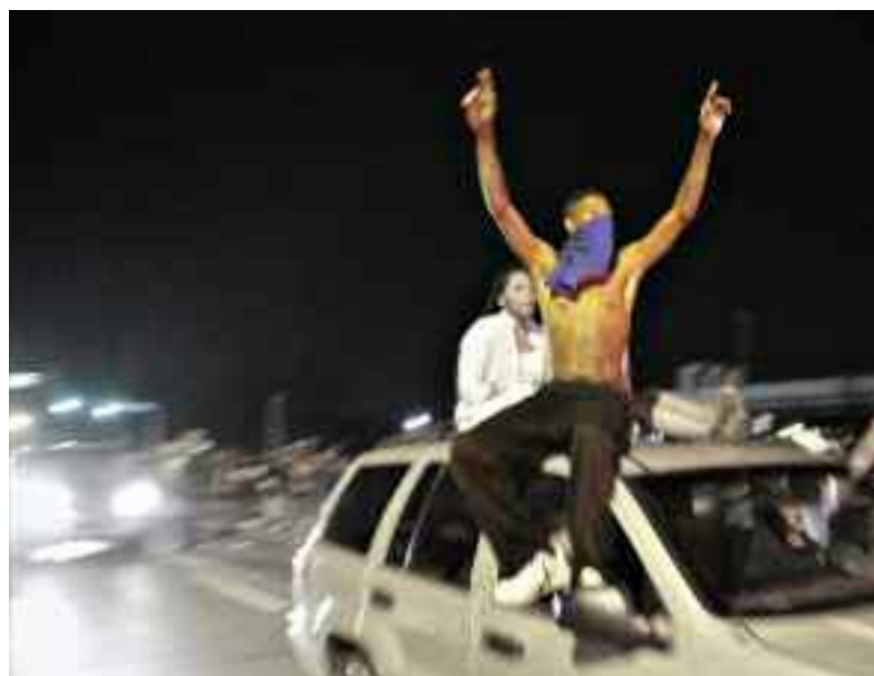
Protesters take to the streets of Ferguson to protest the shooting death of Michael Brown.