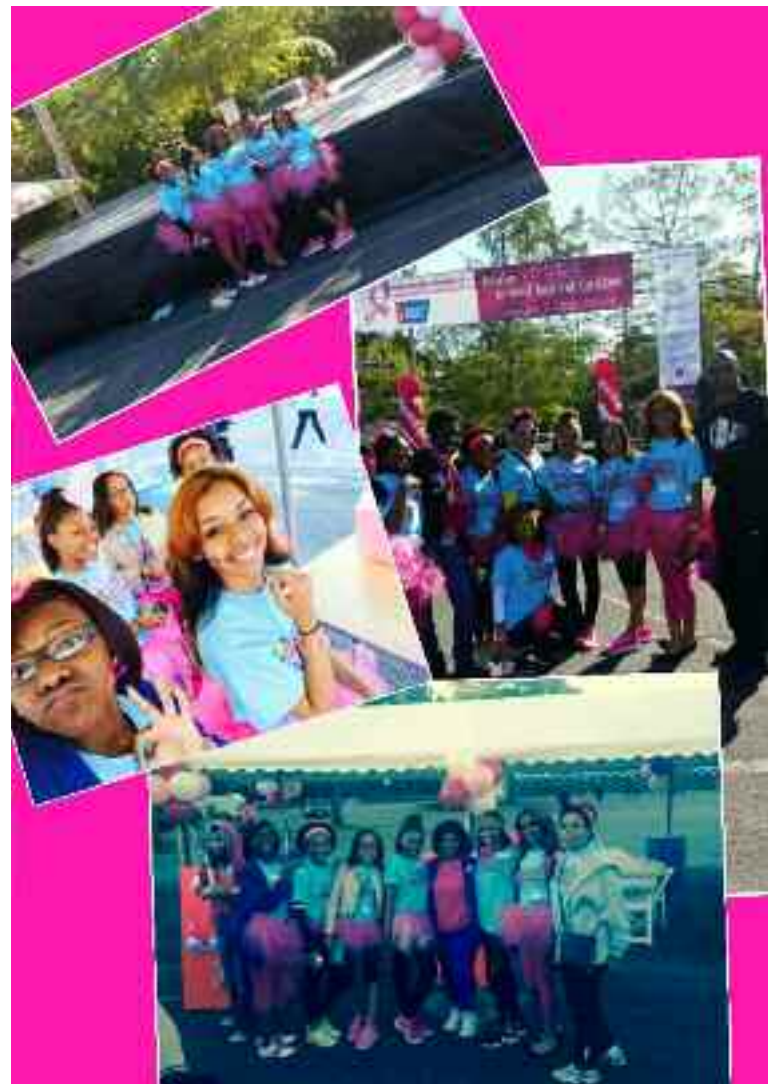
The Young Ladies of IMAGINE WELL, Inc. a local non-profit organization, donned pink tutus and walking shoes to participate in Making Strides Against Breast Cancer of North Texas, a 5K walk benefiting the American Cancer Society. These young ladies chose to support the breast cancer cause after completing the self-image and self-awareness part of the IMAGINE WELL curriculum.