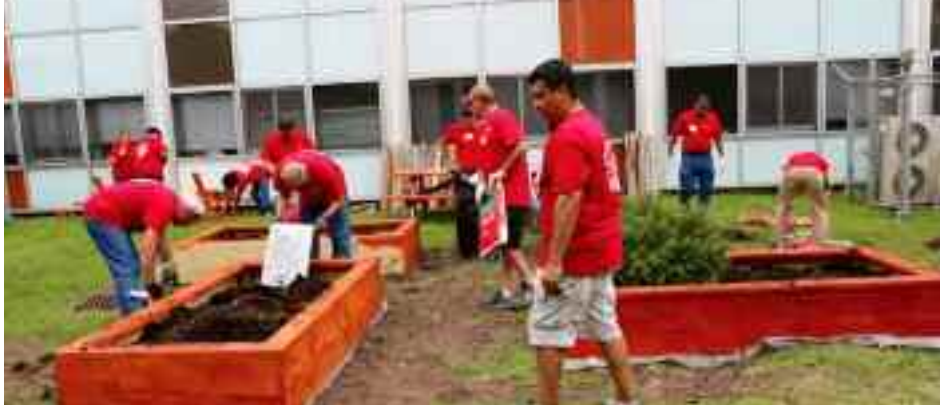
Students and volunteers worked together during a recent campus beautification project at Franklin Delano Roosevelt High School.

City Year Dallas has partnered with a number of Dallas ISD campuses and plans to expand their partnership for the 2015-2016 school year.