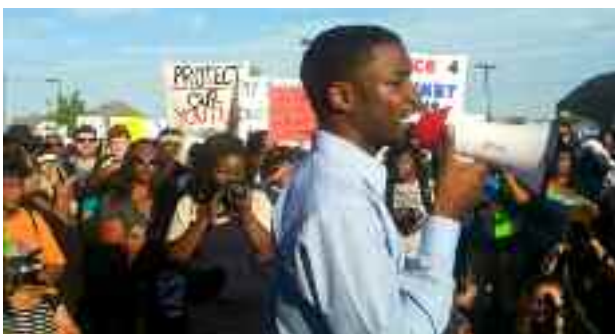
Protesters of all ages stood up to make it known the on-going police brutality would not be tolerated.

Recently in downtown San Francisco topless protesters rallied for female victims of police brutality carrying signs that read #SayHerName which referred to a title of a report released Wednesday by the African American Policy Forum highlighting the violence black women face at