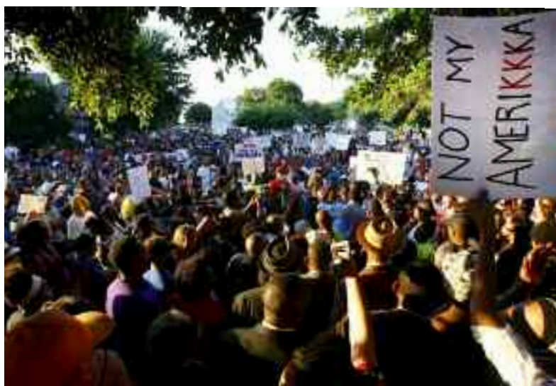
An impressive crowd turned out Monday night to protest police brutality in Texas.