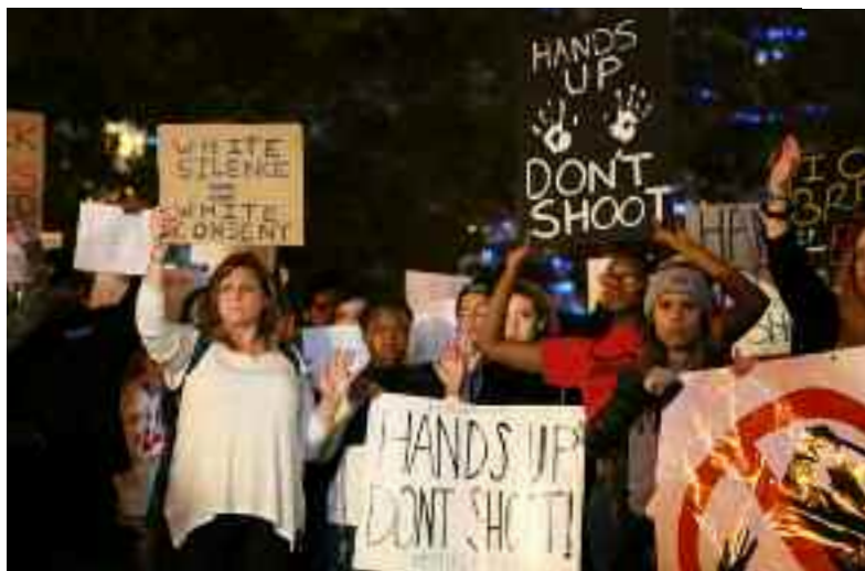
Las Vegas protesters earlier in 2015