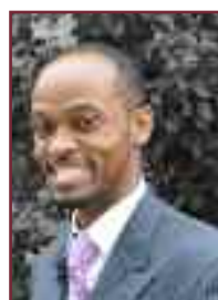
Ramon Hodridge, Minister