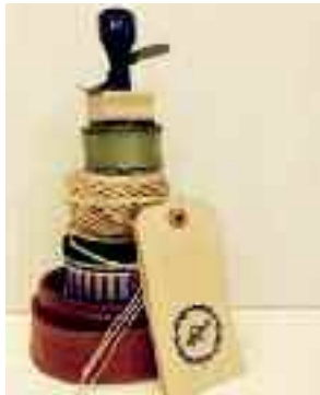
It is titled "Time to Wrap" as is designed to highlight the use of the personalized stamp product for making gift tags.

Expressionery is a website offering affordable customized stamps to use for your mailouts until it is time to invest in pre-printed stock. And even later the stamps are great for items such as gift tags, promo-