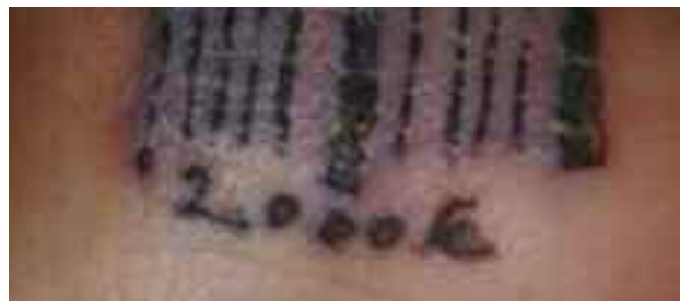
The wrist of a woman rescued by the Spanish National Police after being forced into prostitution. Beneath the bar code, the tattoo shows the amount of money she owed her traffickers.