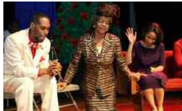
Look back at 2014 TeCo's Black Nativity

Visit our Facebook page for a chance to win tickets! Like and Share the post with your friends and family. Or purchase tickets for the show on stage Dec. 10-20, 2015 at TeCo's website.