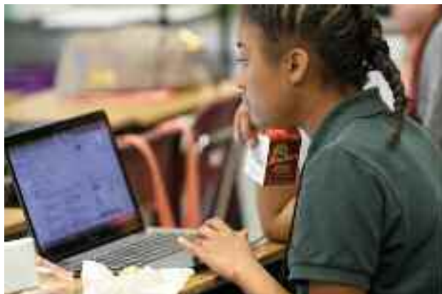
All Dallas ISD high school students can now receive free breakfast in the classroom, a program that previously offered free meals to primary and middle school classes.