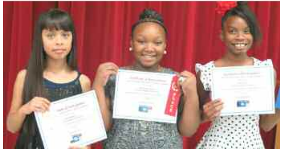
Some 2015 Gardere MLK Oratory Competition participants pose for a quick picture ahead of the semifinal round of the contest.

The winners from this round of competition will present their speeches at the finals at 11 a.m. Friday, January 15, 2016, at the Majestic Theatre in downtown Dallas.