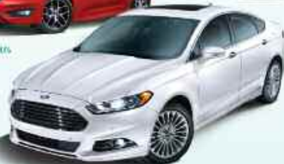
2016 Ford Fusion