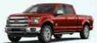
2015 Ford F-150

There are a lot of reasons to love the holidays. And now Ford, America's best-selling brand, 1 is giving you more with low financing on cars, trucks and SUVs. Plus, big Holiday Bonus Cash on select vehicles. So, hurry to your Ford Dealer, for the best gift ever!