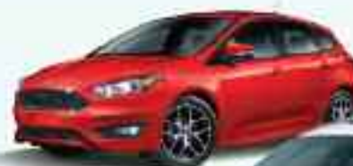
2015 Ford Focus