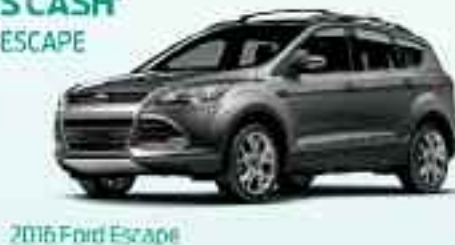
2016 Ford Escape

$1,000 HOLIDAY BONUS CASH 1 ON 2015 FOCUS / 2016 FUSION & ESCAPE