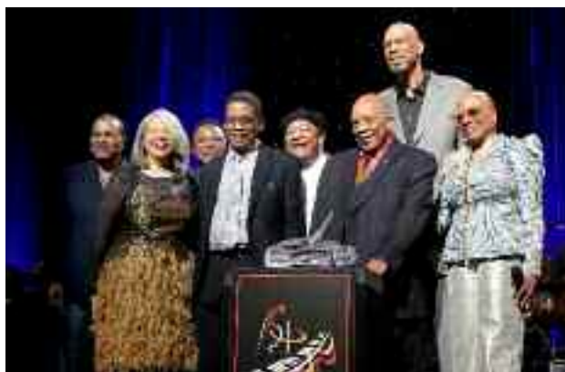
(L-R) Billy Dee Williams, Patti Austin, George Benson, Herbie Hancock, Al Jarreau, Herbie Hancock Humanitarian Award recipient Quincy Jones, Kareem Abdul-Jabbar, and Dee Dee Bridgewater speak onstage during the Thelonious Monk Institute International Jazz Vocals Competition 2015 a tribute to Quincy Jones held at Dolby Theatre on November 15, 2015 in Hollywood, Calif.

"Quincy Jones has demonstrated his concern and caring for countless people worldwide through a broad range of musical, educational, and relief initiatives. I have known Q for over 50 years and there is no one more deserving of this award. For many decades now, he has continued to support, encourage, and nurture the younger