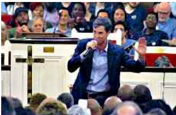
Senate candidate Beto O'Rourke delivers a highly-charged speech to attendees at the town hall held in the historic Good Street Baptist Church in South Dallas. O'Rourke made note of the fact it was the same church where a sermon on civil rights was delivered by Dr. Martin Luther King, Jr.