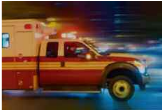
American Stroke Association

Worldwide, stroke is the No. 2 cause of death and is a leading cause of long-term disability. Stroke is more disabling than it is fatal.