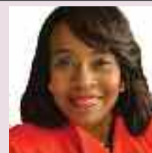
Dallas City Council District 4 Carolyn King Arnold