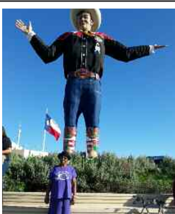
Another year of the State Fair of Texas has come and gone. There was a lot of rain this year, so we are hoping everyone had a chance to enjoy the festivities on what clear days we did get.

and mind. Pray that God will provide you with His calmness and to fill you with good thoughts and actions as you interact with the people around you. In the name of Jesus Christ pray and don't forget to offer God praise for what He does.