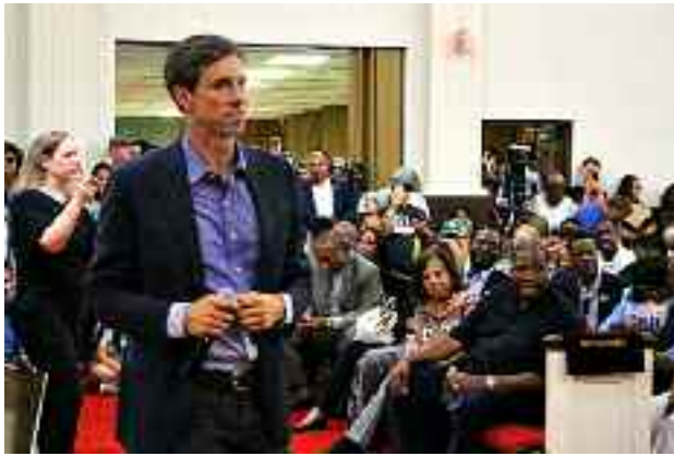
Many Democrats are placing their hopes in El Paso Congressman Beto O'Rourke (shown above at a recent campaign stop in South Dallas) to gain a Blue spot in a deep Red Texas, but there are other competitive races to keep an eye on as well.

to be believed, the Democrats best chance at taking a significant office in the Lone Star State comes with the showdown between sitting U.S. Senator Ted Cruz, and Beto O'Rourke, who comes into the race a challenger from the U.S. House of Representatives.