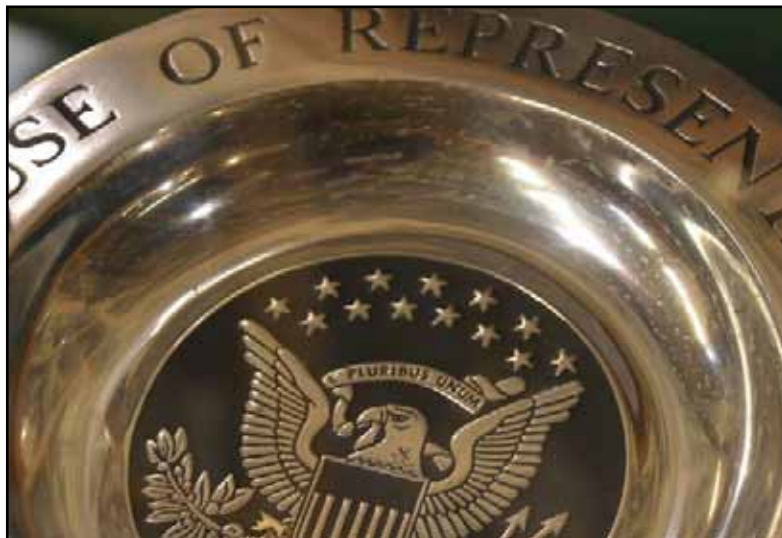
The FUTURE Act, which stands for Fostering Undergraduate Talent by Unlocking Resources for Education, unanimously passed the Senate.

"Historically Black Colleges and Universities, Tribally Controlled Colleges or Universities, and other Minority-Serving Institutions (MSIs) play a significant role in expanding access to higher education for low-income students and students of color," said Scott, the Chair of the House Committee on