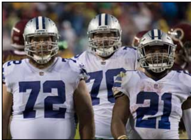
The Dallas Cowboys, who have been struggling in the past few weeks, showed up in force for the game against the Los Angeles Rams. (Photo: KA Sports Photos / Flickr)â

"That's what we did (Sunday) through adversity and success. A bunch