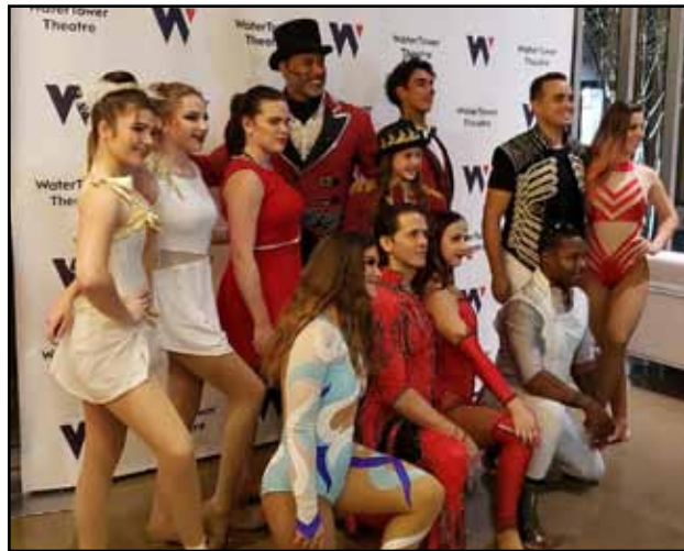
Cirque Holiday Cast for the show at Addison's Water Tower Theatre. (Courtesy photo)

Cirque Holidays at the Water Tower Theatre in Addison is an enjoyable and entertaining look at a little girl in search of the Christmas spirit. Not only