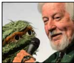
Oscar the Grouch (left) and Carol Spinney

Produced by the Children's Television Workshop, Sesame Street was a show written specifically for "the four-year-old inner-