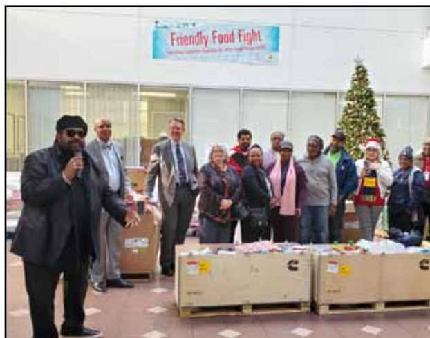
Participants celebrate raising $7,000 and tons of food during DART's annual charity event.