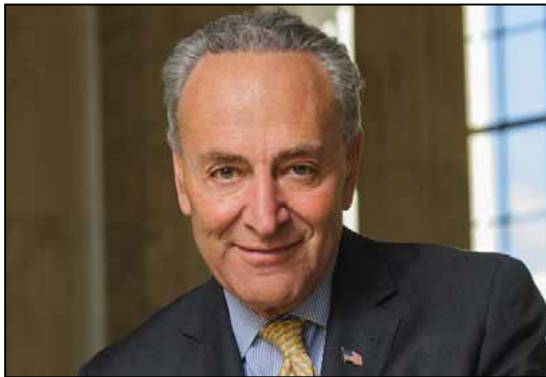
U.S. Senator Chuck Schumer (D-NY) recently shared some insight on impeachment and his conversations with Senate Majority Leader Mitch McConnell (R-Ky.), and House Speaker Nancy Pelosi (D-Calif.).

"What motivates these Republicans to just circle the wagons? And, whatever this president says, who is known for having a low moral char-