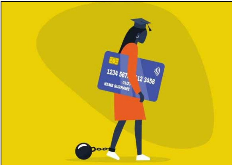
While African Americans have seen a decrease in their overall unemployment rate, a new study shows that this improvement doesn't translate into real wealth.