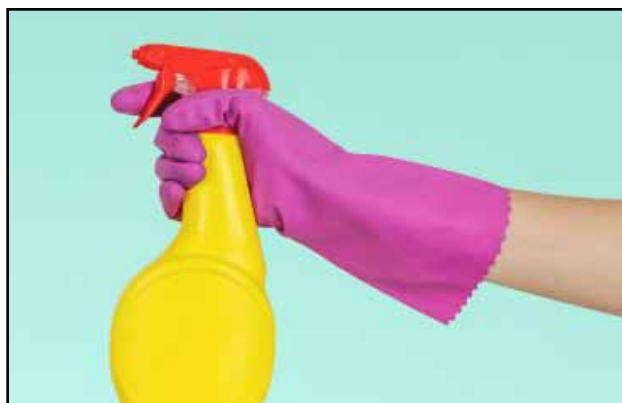
Right now everyone is seeking coronavirus prevention ideas. Time to step up your spring cleaning efforts.

The first of these benefits is allergy reduction. De-