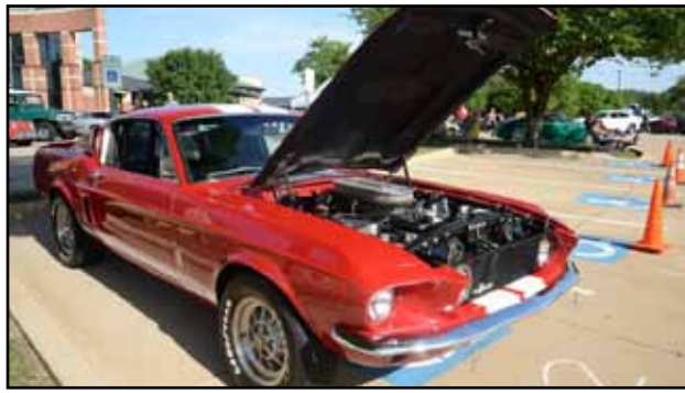
The Heights Car Show is a treasured Richardson tradition.