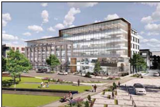
New centerpiece office complex at the Trinity Mills Station in Carrollton.

The City and DART collectively own 26 contiguous acres of land that will comprise Trinity Mills Station, a future transit center district,