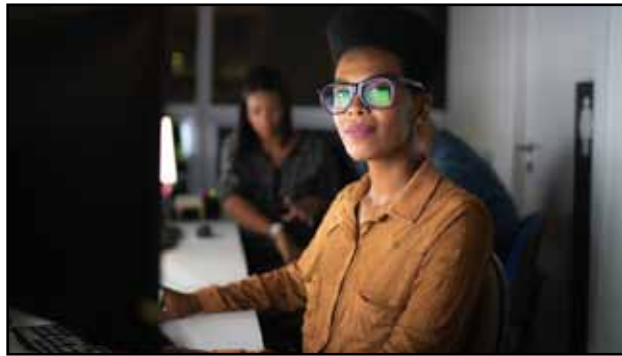
Compared to other small business owners, African Americans have generally had to face more daunting challenges such as smaller cash reserves to draw from, difficulty in securing bank loans and other financing and being sole proprietors or “mom and pop” establishments that are ineligible for most small business loans.