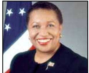
Carol Moseley Braun, the first African American female senator and the former United States Ambassador to New Zealand and Samoa has endorsed Royce West in the Texas Senate Race

To volunteer, register via the Sign-Up Genius links located at Network's website and Facebook page. Watch one volunteer's experience with making deliveries in a new video created by the City's Communications Department.