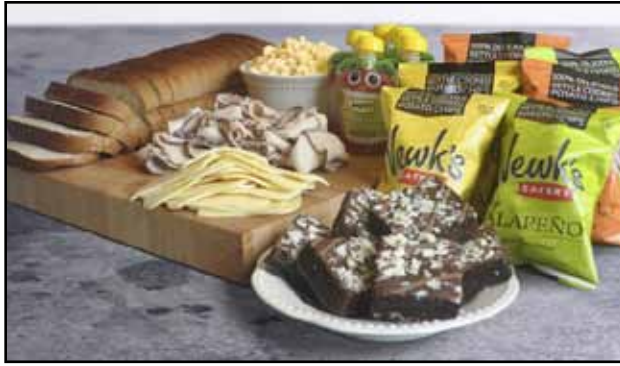
Newk's Family Lunch Essentials

While many are looking for ways to fill their refrigerators and grocery store shelves are close to empty, Newk's Eatery has launched Newk's Pantry. The new service is offering guests and local communities a small footprint of grocery items and meal kits in-store, available through curbside pickup and delivery.