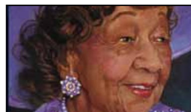
Dr. Dorothy Irene Height

See Page 2 to see what NDG readers are saying about the latest news!