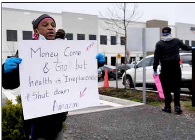
Many have expressed anxiety about facing a kind of "Sophie's Choice," that is, forced to choose between going to work and possibly risk being exposed to the coronavirus or staying at home and not being able to put food on the table or pay bills.

Nationally, workers have voiced similar complaints about a lack of protective equipment such as masks, inefficient sanitizing of workspaces, and failure by some