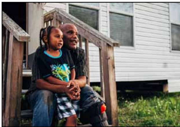
MOSSVILLE is the story of long-time African American residents of a town in Louisiana

The 2020 EarthxFilm festival is supporting filmmakers financially during the COVID-19 crisis, with screening fees and online donations collected for the