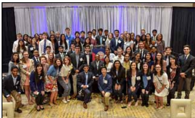
Graduates of the Plano Mayor's Summer Internship Program are normally recognized at a special luncheon upon completion. However, this year, due to the coronavirus pandemic, these students will be recognized in a drive-by parade.