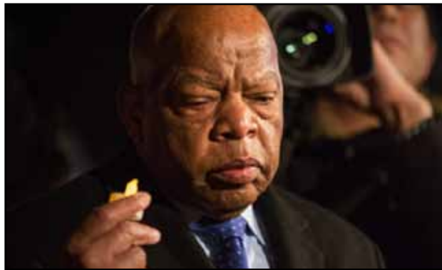
Lewis announced late last year that he had Stage 4 pancreatic cancer. However, stalwart in his resolve to fight until the end, he refused to quit the struggle. "I have been in some kind of fight — for freedom, equality, basic human rights — for nearly my entire life," he said, "I have never faced a fight quite like the one I have now."

National Newspaper Publishers Association (NNPA) President and CEO, and comrade in arms with both Rev. Vivian and Lewis, ex-