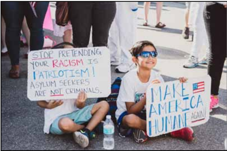
Immigration issues have been a mainstay of the Trump administration since the day he announced his candidacy. Now, Census policy has intertwined with immigration making Democrats and civic organizations cry foul.

"Giving congressional representation and political influence to illegal aliens – people who have blatantly disregarded our laws – would be a perversion of our democratic principles," the White House said in a written statement. "Allowing illegal aliens to be counted for the purpose of apportionment could also create perverse incentives – such as potentially rewarding states that encourage violations of Federal immigration law – that would undermine our system of government."