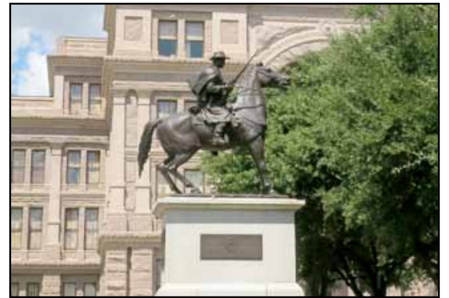
A statue memorializing Texas Confederate soldiers sits in front of the State Capitol in Austin, one of the monuments House and Senate leaders are seeking to remove.

“As a life-long Texan, and descendant of slavery, I join this diverse coalition of my colleagues in the House and Senate as we call for the removal of threatening Confederate imagery from the Capitol grounds. The goal is clear: We must ensure that every walkway and hallway of our Capitol is viewed as a safe space for all Texans.”