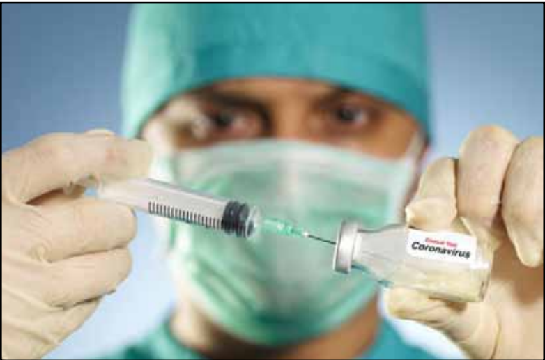
Pfizer's vaccine is the first in the United States to generate late-stage data.

"We are reaching this critical milestone in our vaccine develop-