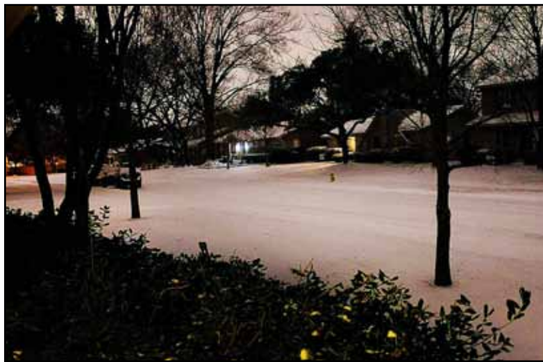
In an overnight onslaught of winter weather last week, the Dallas area was blanketed with snow and ice, and the ensuing power outages resulted in life-threatening complications for many across Texas.

Texas Governor Greg Abbott asked for the performance of ERCOT during the storm, as well as the winterization of the Texas power grid to be added as emergency