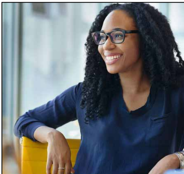
The 2021 National Student Entrepreneurs Summit (NSES) and Pitch Competition supports the next generation of student entrepreneurs.

On Saturday, March 6, Business Arsenal Credit Repair and Business Arsenal University, in conjunction with Harvard Alumni Entrepreneurs NYC, Queens College, and the HBCU Foundation, will present the 2021 National