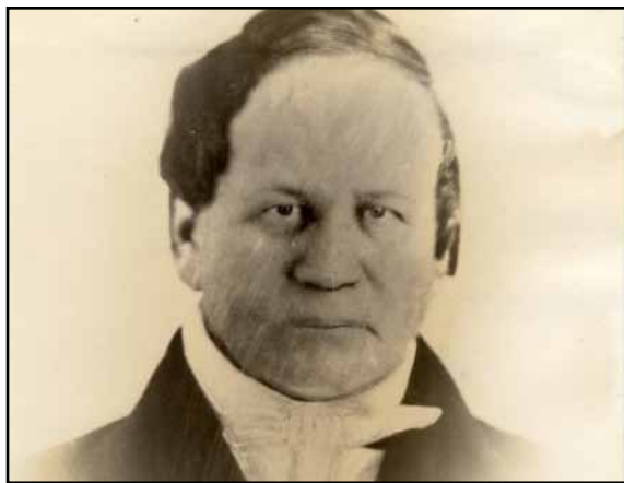
Professor Alexander Twilight

He was ordained a Congregational clergyman in