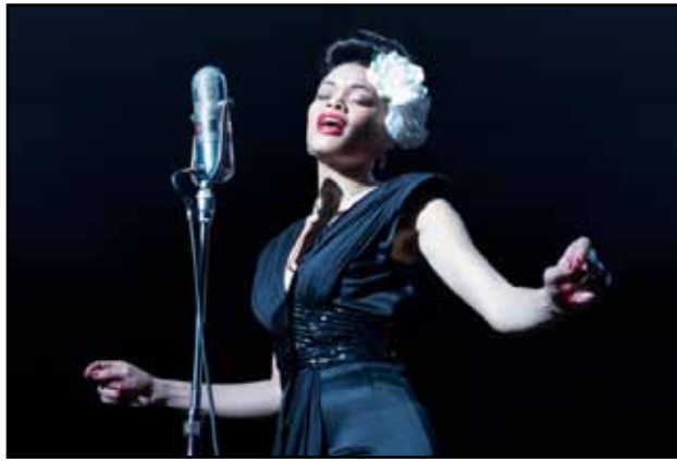
Andra Day gave a knockout performance as the iconic singer.

Director/producer Lee Daniels has been building up to this moment. Producing strong women's stories (Precious), casting actors in career-changing, award-winning roles (Halle Berry, Monster's Ball) and chronicling African American history (Lee Daniels' The Butler). Now, he's hired Pulitzer Prize-winning playwright Suzan-Lori Parks (Topdog/Underdog) to adapt "The Black Hand," a chapter from Johann Hari's 2015 bestseller, Chasing the Scream: The First and Last Days of the War on Drugs. That segment of the book focuses on the Feds chas-