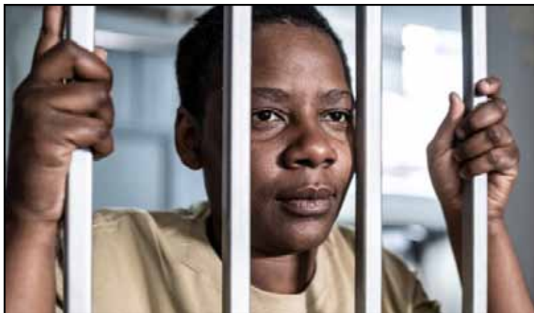
According to the report, several states in the United States have also failed to meet several of the UN's Standard Minimum Rules for the treatment of incarcerated people.

Among the ongoing stark racial disparities throughout prisons in the southern United States, Black