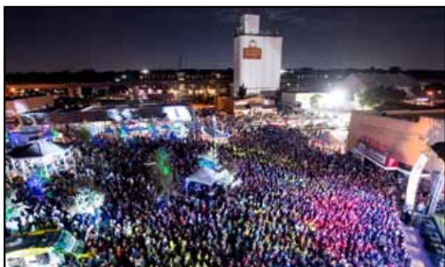
City of Carrollton

Formed in 1981, Soul Asylum broke through commercially with the double-platinum 1992 album Grave Dancers Union . The full-length album earned steady alternative radio and MTV airplay on the strength of the Billboard Hot 100 Top 5 hit "Runaway Train," which won the Grammy for Best Rock Song in 1994. Adding power to the album was number one modern rock smash "Somebody to Shove," as well as "Black