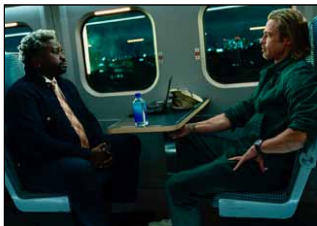
Bryan Tyree Henry and Brad Pitt costar in Bullet Train.