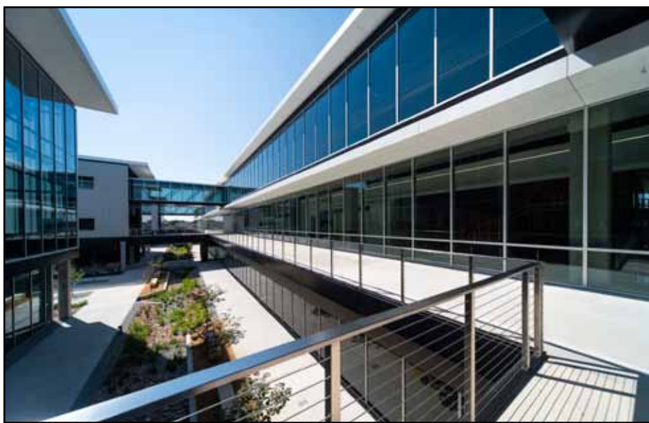
Collin College Technical Campus, winner of the Caudill Award

The project was designed and completed in 2020 by Perkins & Will. "We are excited about this recogni-