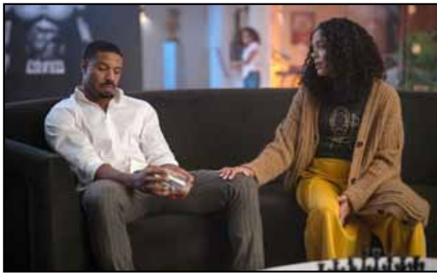
Michael B. Jordan and Tess Thompson in Creed III.

Maybe the real measure of Jordan's creative abilities is best displayed in the boxing scenes. He doesn't disappoint. Fights with Chavez, Dame and Adonis are innovatively shot. Es-