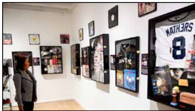
Three Rap Legends event will kick off at 4pm with a live broadcast of "Master Gee's Theatre," the museum's executive director's weekly Sirius XM show.

"We had to put something in effect that would last over generations," Gee