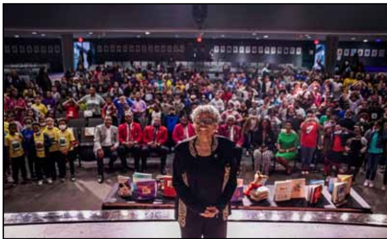
Dr. Opal Lee takes a moment to grab a momento photo with the Students of DeSoto High School.

"Reading is just so essential!" said Dr. Lee. "I just want to tell everyone to learn to read. If you cannot read, you cannot get anywhere, interact with others, or teach your children," said Dr. Lee, as her goal for this visit to DeSoto ISD students. "You should start reading when you learn to walk."