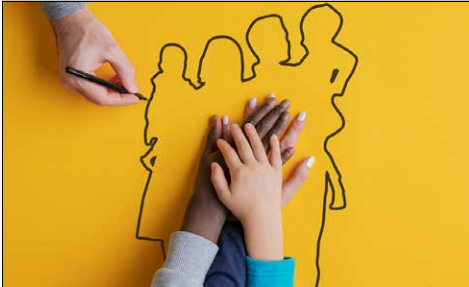
The issue of adultification is deeply rooted in societal biases and stereotypes, manifesting in harsher disciplinary actions in schools and more severe judgments in the criminal justice system.