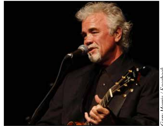
Gary Morris / Facebook

Additional Broadway roles include Rodolfo in the production of Puccini’s opera “La Bohème” with Linda Ronstadt.