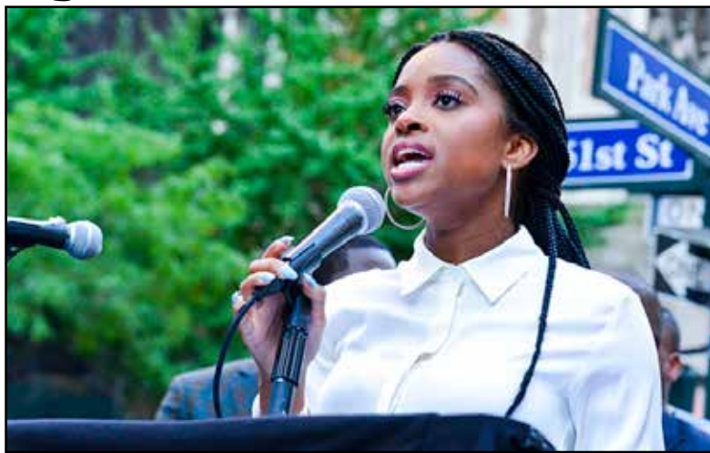
President Joe Biden and Vice President Kamala Harris have repeatedly warned in campaign speeches that if Donald Trump wins a second term, he plans to use the conservative blueprint to exert unprecedented presidential power, eliminate the Department of Education and federal housing assistance, and significantly cut or restrict food stamps and other social welfare programs. (Image via NNPA)

Trump has tried to distance himself from Project 2025, calling some of the proposals "seriously extreme," but its architects helped shape his Republican Party platform. Project FREEDOM, the organizers said in a virtual news conference, is designed to engage Black voters in four key battleground areas.