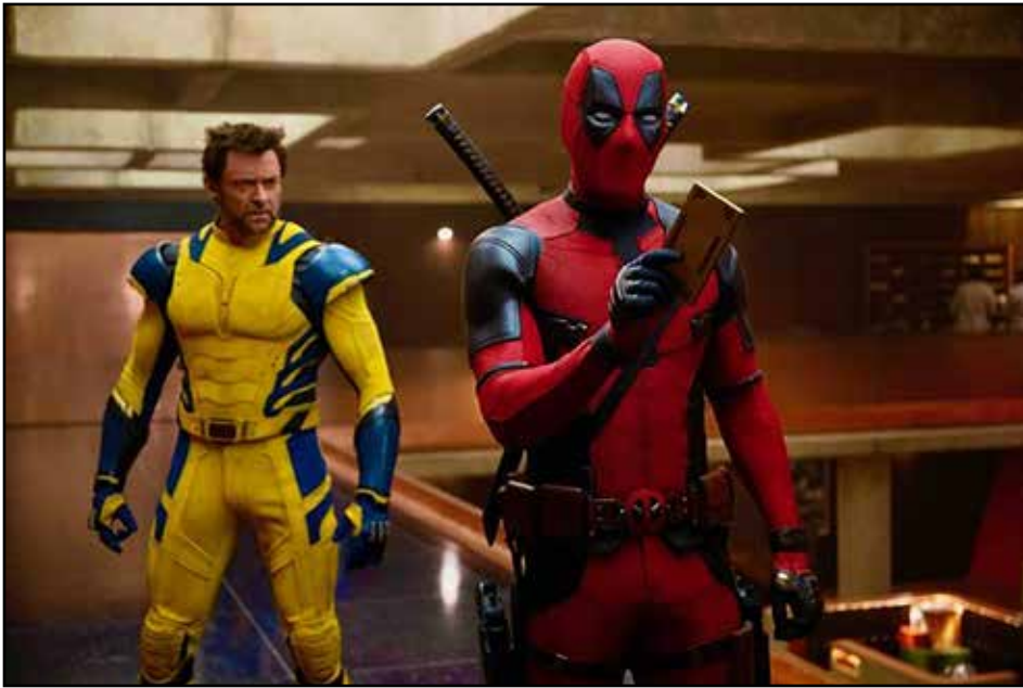
Hugh Jackman and Ryan Reynolds in Deadpool & Wolverine.