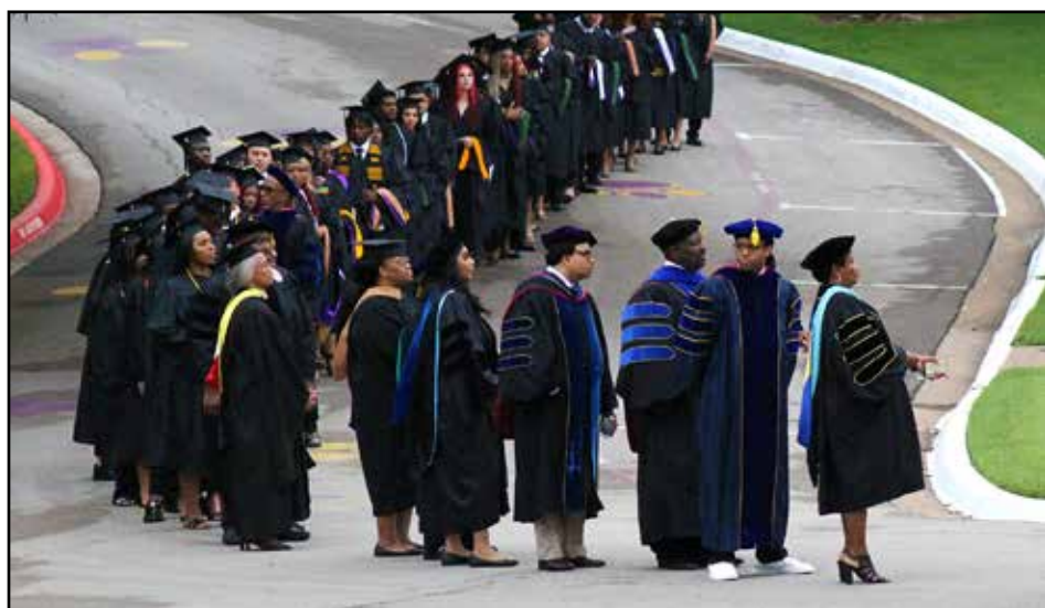
Paul Quinn proudly educates students of all races and socio-economic classes under the banner of its institutional ethos, WE over Me. It is the first Urban Work College and only minority-serving, federally recognized work college in America. Paul Quinn is viewed as one of the most innovative colleges in America, one that continuously expands the boundaries of higher education and community advocacy in its quest to eradicate intergenerational poverty.

• Enhance the school's outdoor collaborative learning spaces. To invest or partner with Paul Quinn College, please visit www.pqc.edu/invest .