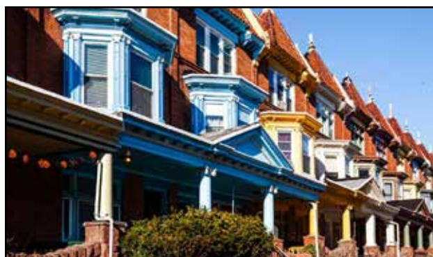
Rising premiums and insurer withdrawals are creating a financial disaster that threatens national property values and economic stability.