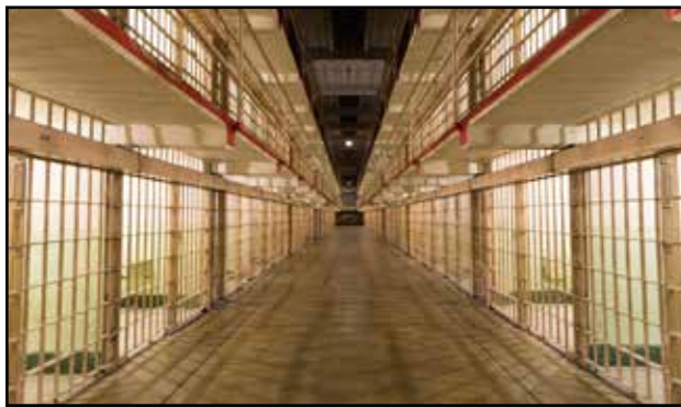
The White House said the latest decision aligns with the administration's ongoing efforts to curtail the federal death penalty, leaving only three individuals still sentenced to death at the federal level.