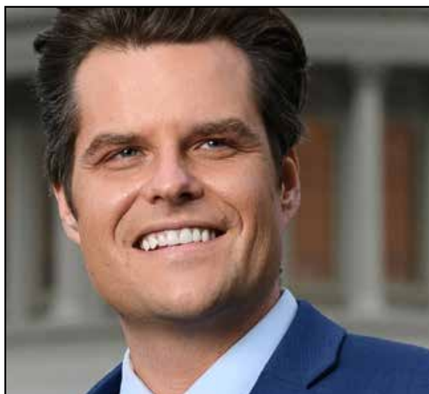
Ike Hayman / Wikimedia