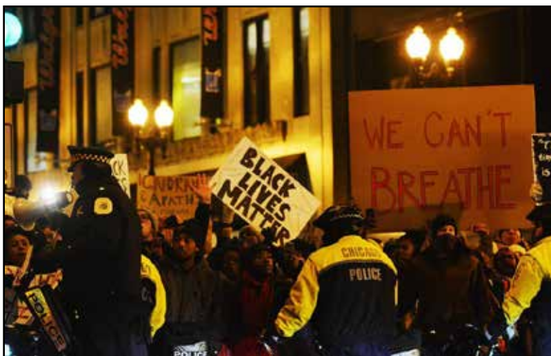
The report, part of a series examining police interactions with U.S. residents since 1996, reveals that racial disparities in these encounters persist.

The BJS data show that Black drivers are more than twice as likely as drivers of other racial groups to be searched or arrested during a traffic stop. Black individuals are also over three times as likely as White individuals to experience the use of force in their most recent encounter with law enforcement. Although Black people accounted for only 12% of those whose most re-