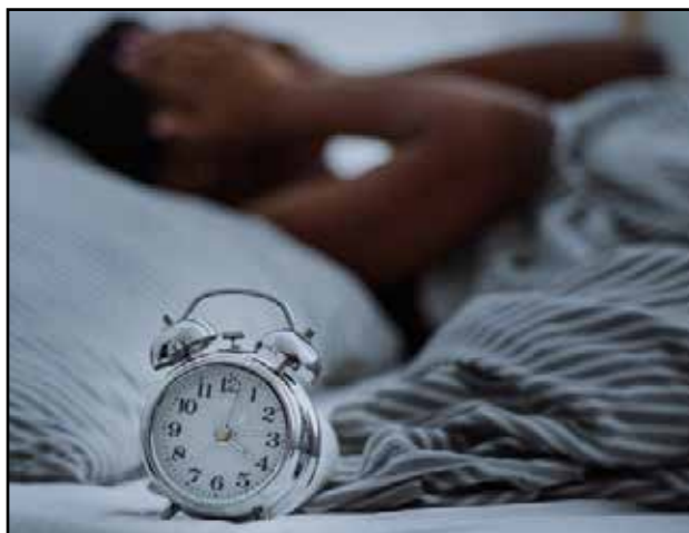
Trump's proposal aligns with calls from health experts who have long warned about the negative impact of ending daylight saving time.

Daylight saving time shifts daylight to later hours, offering extended evenings during warmer months. On the other hand, standard time prioritizes morning light, which is especially valued in the winter when children head to school. Trump's proposal aligns with calls from health experts who have