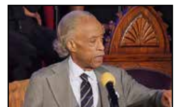
Rev. Al Sharpton

NDG Quote of the Week: "Success is liking yourself, liking what you do, and liking how you do it."