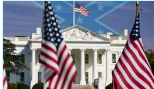
WH