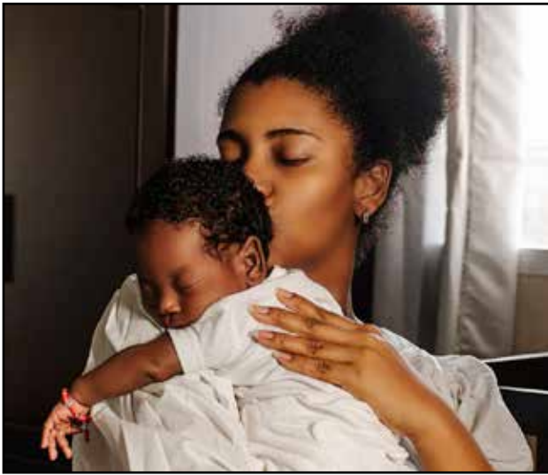
By the 2010s, the rate had declined to 1,073 per 100,000 for Black infants and 499 per 100,000 for white infants, yet the disparity grew to a mortality ratio of 2.15.