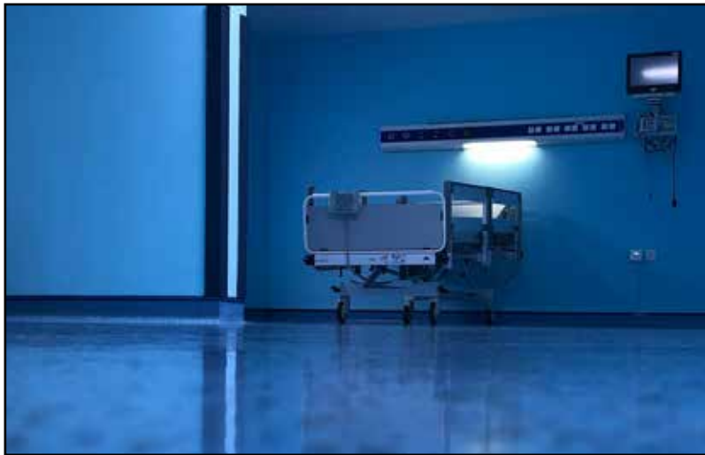
A House Budget Resolution narrowly passed with only Republican support, paving the way for deep cuts to Medicaid, SNAP, and other safety net programs in order to offset massive tax breaks that primarily benefit the wealthy.