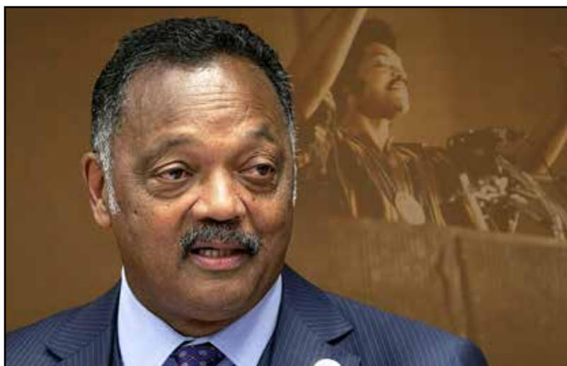
The Rev. Jesse L. Jackson, Sr., seen by many as the "last of the great civil rights warriors of the 1960s" passed away on Tuesday morning after a lengthy period of declining health.