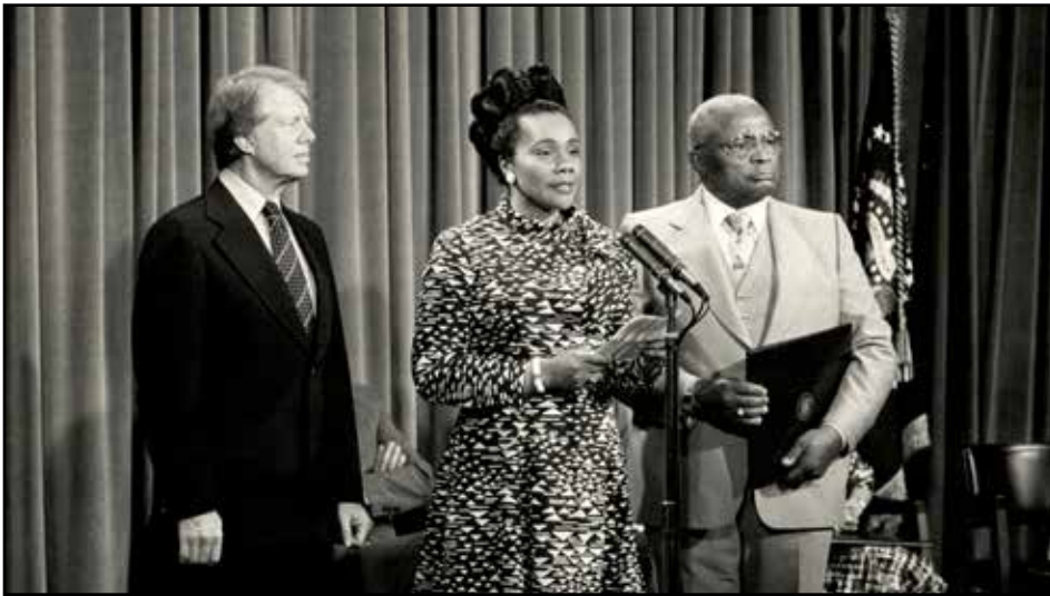
Connect2OTT currently manages more than 250 live 24/7 television and radio channels streaming to audiences in more than 190 countries. Civil Rights TV joins this ecosystem as a flagship channel, designed to foster global conversation while demonstrating how media distribution, energy efficiency, and AI readiness can coexist responsibly.