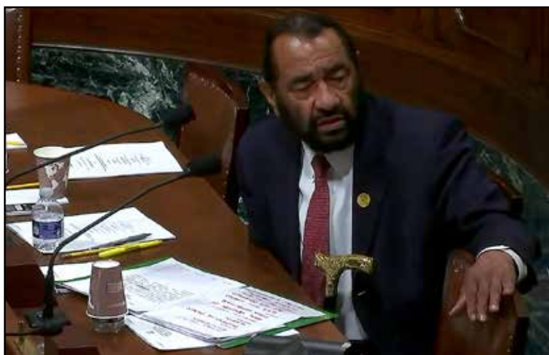
While U.S. Rep. Al Green (D-TX9) makes headlines confronting the Trump administration overtly, grassroots Democrats are quietly filing in to early voting ballot locations in record numbers across the state.

While Green differs from the administration on numerous grounds, the depiction of former President Barack and First Lady Michelle Obama as primates on a public platform was an insult not to be left un-