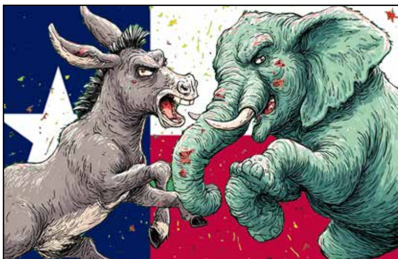
The decision to change the format of countywide voting by the Dallas County GOP led to voter confusion, which was further complicated when Texas Attorney General Ken Paxton objected to a decision to extend voting hours. The result was a chaotic squabble that put Dallas County in the national spotlight on election day.

"Unfortunately, this is what Republicans like to do," U.S. Rep. Jasmine Crockett, currently running