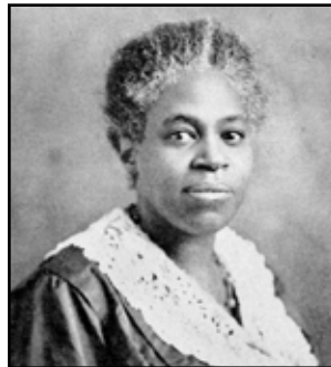
Delilah L. Beasley

Knowing Black women's achievements challenges stereotypes and upends social assumptions about